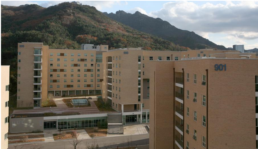
(▲ SNU Gwanak Residence Halls for Graduate Students)