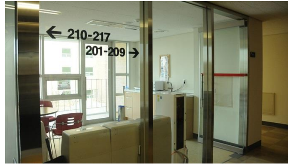
(▲SNU dormitory buildings and facilities)